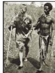
The Kokoda Track Foundation

Once again guys, thank you from the bottom of my heart (as a mum). What you do is amazing and you should be so proud. Watching my daughter's experiences has brought back to me the spirit of what PCYC is all about.